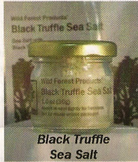
Black Truffle Sea Salt