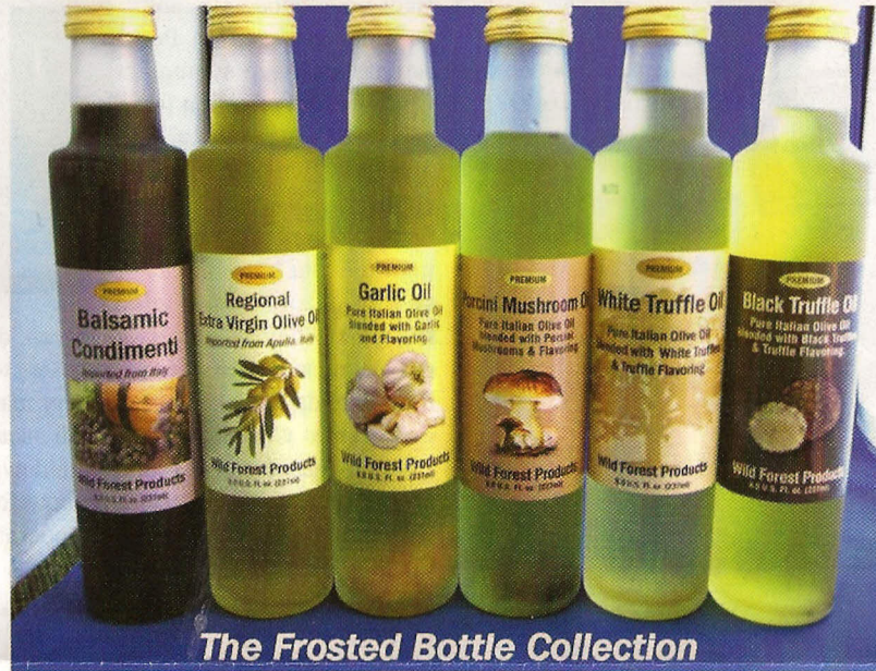
The Frosted Bottle Collection