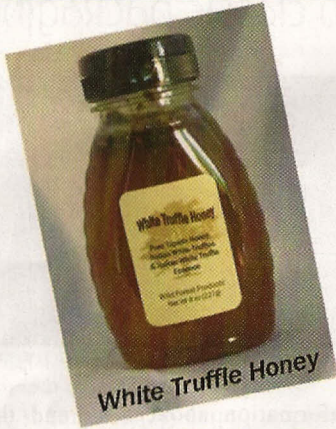
White Truffle Honey