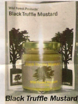
Black Truffle Mustard