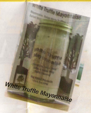
White Truffle Mayonnaise